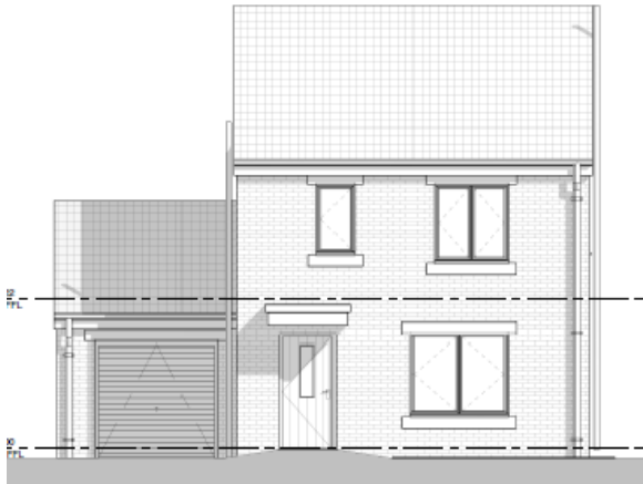
Cobalt House Type (3 bedrooms)