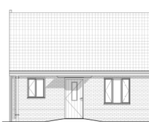
Maya House Type (2 bedrooms)